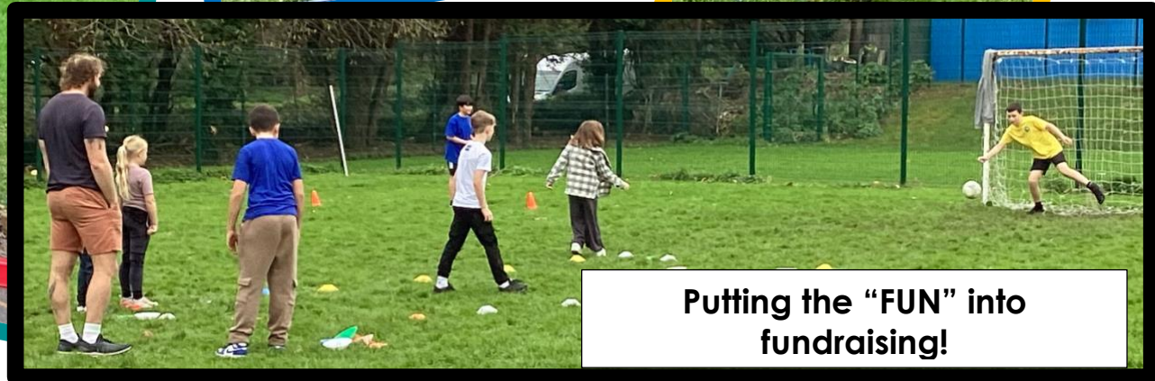
Putting the "FUN" into fundraising!